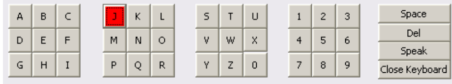
Fig. 3. In this example, the second group was selected, and now, the scanning system is focused on the keys of that group, with the cursor advancing through each of the 9 letters (J,K,L,M,N,O,P,Q,R), one at a time.

instant messaging software, especially among young people. For example, in English it is common for people to use “btw” as an abbreviation of “by the way”. Within EasyVoice, the user can define his own abbreviations. The system will automatically replace each abbreviation by the corresponding full spelled words, before sending them to the speech synthesizer.