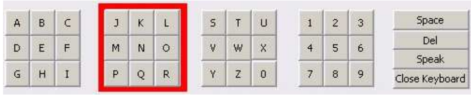
Fig. 2. An example of the scanning system. There are 5 groups of keys, and the cursor advances through each group at a specified time rate.